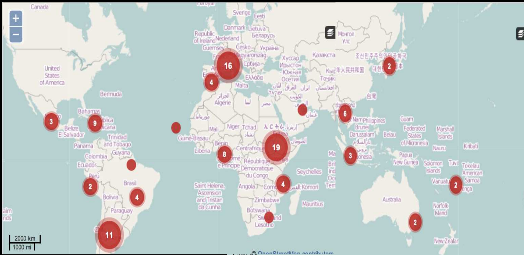
A snapshot of the WCRD 2014 Global Map